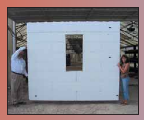
Panelized Wall Assembly (Patent Pending)